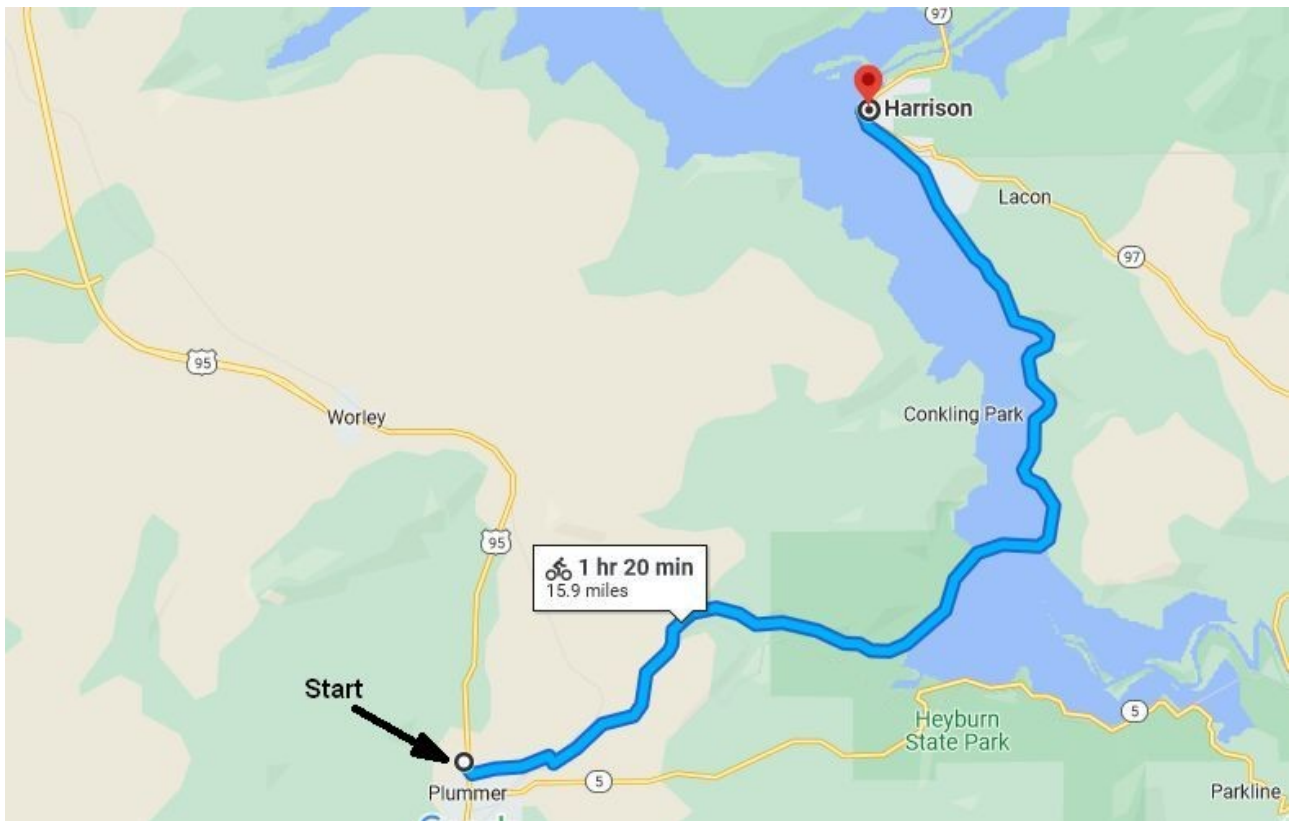
Tuesday - Plummer to Harrison Ride