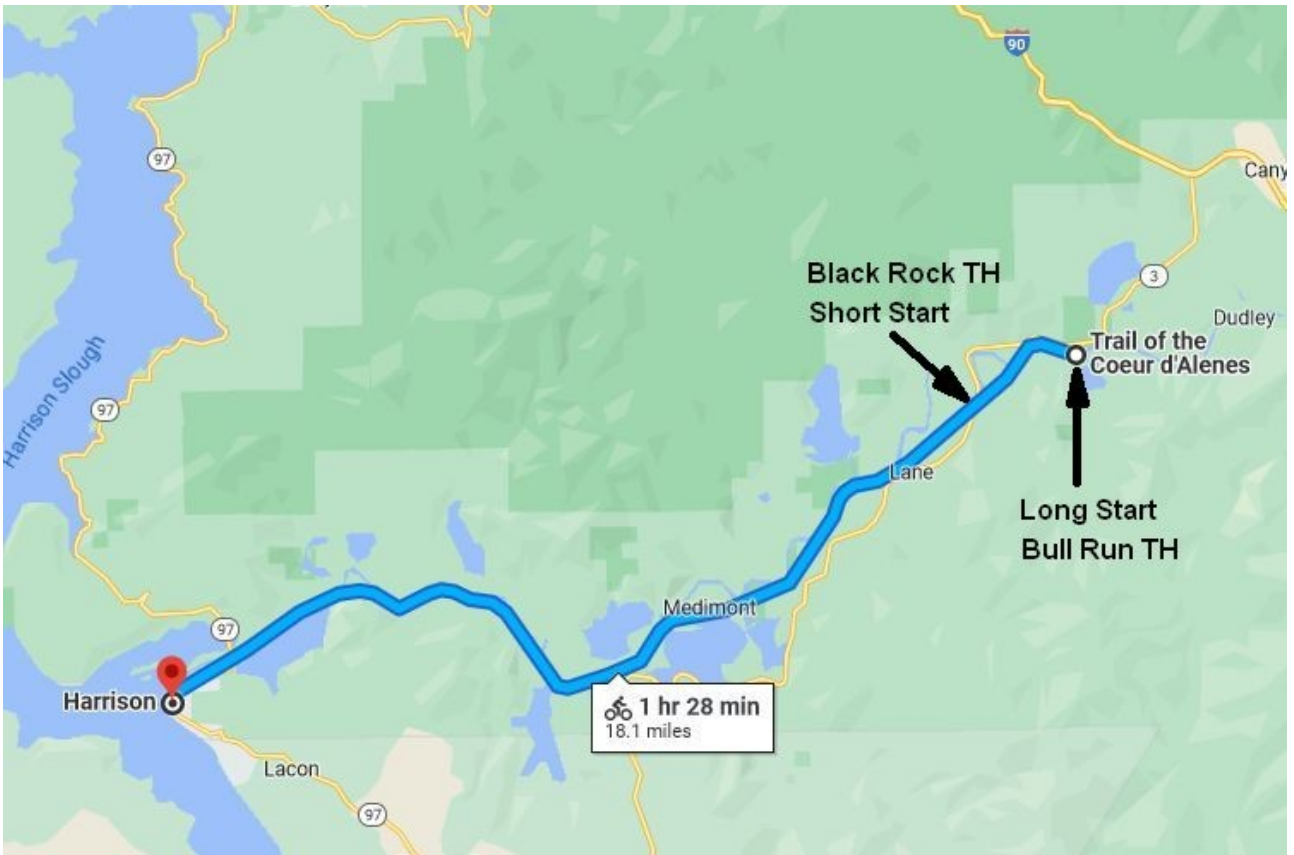
Thursday - Bull Run or Black Rock to Harrison Ride